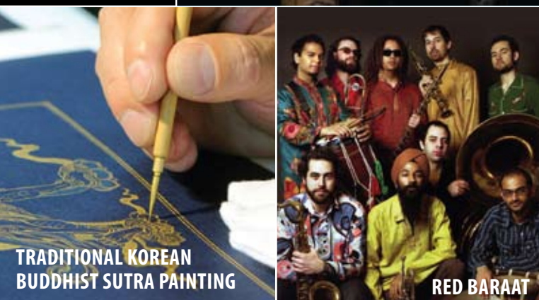
TRADITIONAL KOREAN BUDDHIST SUTRA PAINTING