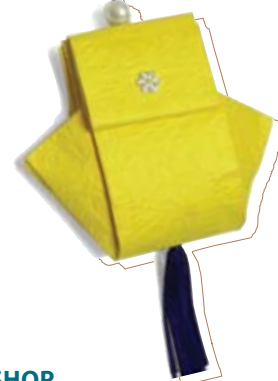
Bokjoo-money lucky bag

Learn how to make a Korean lucky bag (Bokjoo-money). Then write down your wishes for the year and put them in the lucky bag's secret pocket.