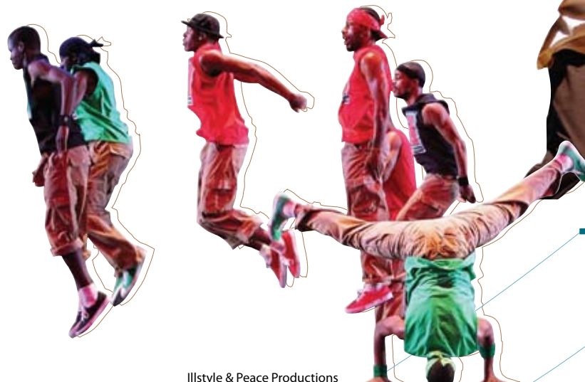
Illstyle & Peace Productions

A fun, challenging class to introduce children and adults to various dance styles such as B-Boying/B-Girling, hip-hop, modern, jazz, African, and more. Learn basic movements and techniques, and develop the movements into combinations. All ages and levels welcome!