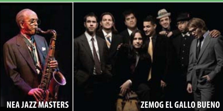
NEA JAZZ MASTERS