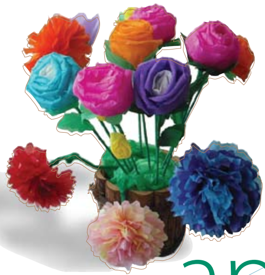
Mexican Paper Flower Workshop