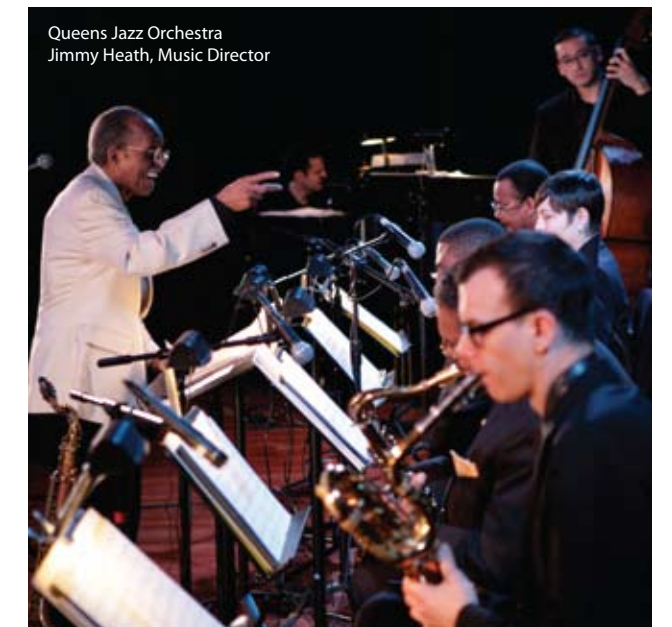
Queens Jazz Orchestra Jimmy Heath, Music Director