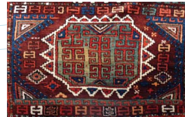
Turkish Material Culture in Historical Context