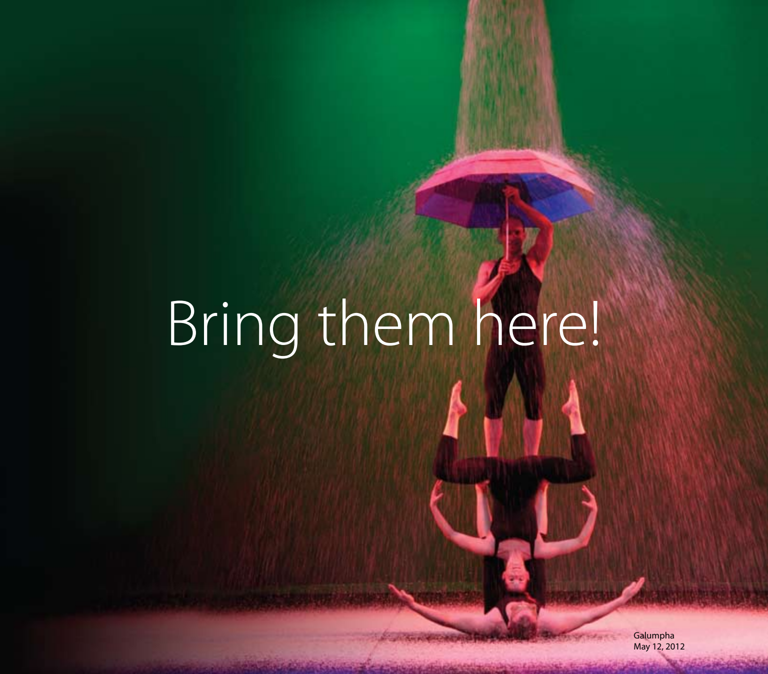
Galumph May 12, 2012