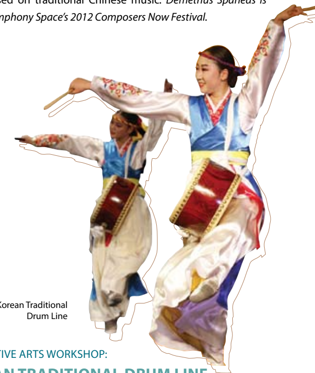
Korean Traditional Drum Line