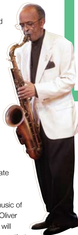
Dr. Jimmy Heath, QJO Music Director & Conductor