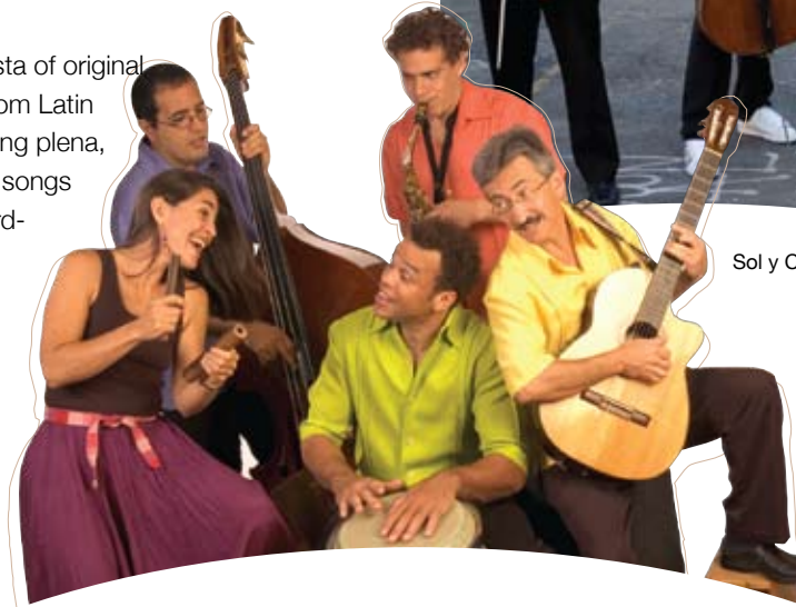
Sol y Canto

Call the Education Department at (718) 463-7700 x241.