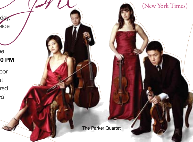
The Parker Quartet

“Something extraordinary” (New York Times)