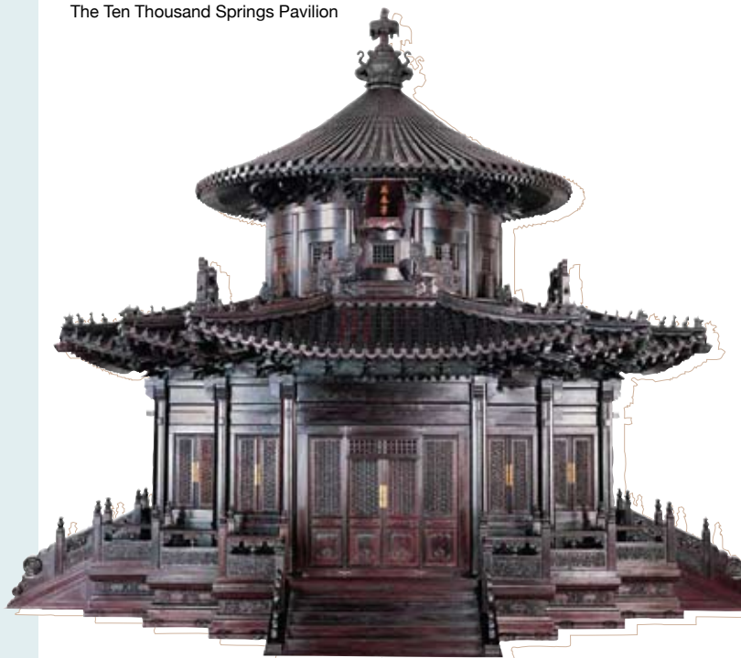
The Ten Thousand Springs Pavilion

FOR MORE DETAILS, PLEASE CALL OUR MEMBERSHIP DEPARTMENT AT (718) 463-7700 x260.