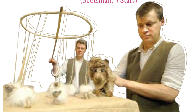
Puppet State Theatre